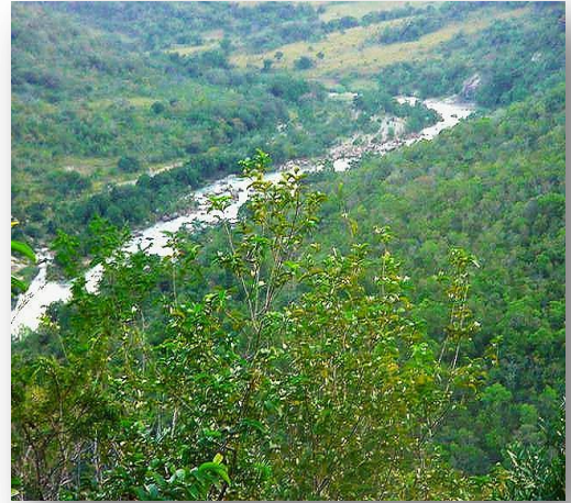
The view of the Nkomati from the trail down to the paintings

Ancient figures meticulously drawn on the rock in the cave portray the dance, fight and hunting of a period naturally lived.